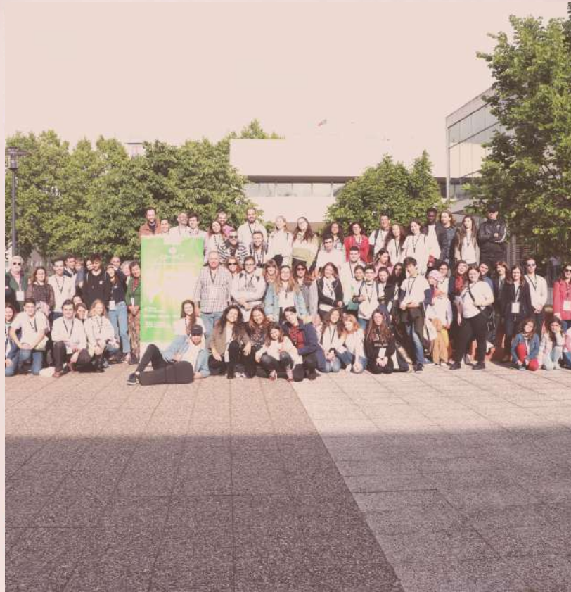
CLIMACT TEAM 2016-2019